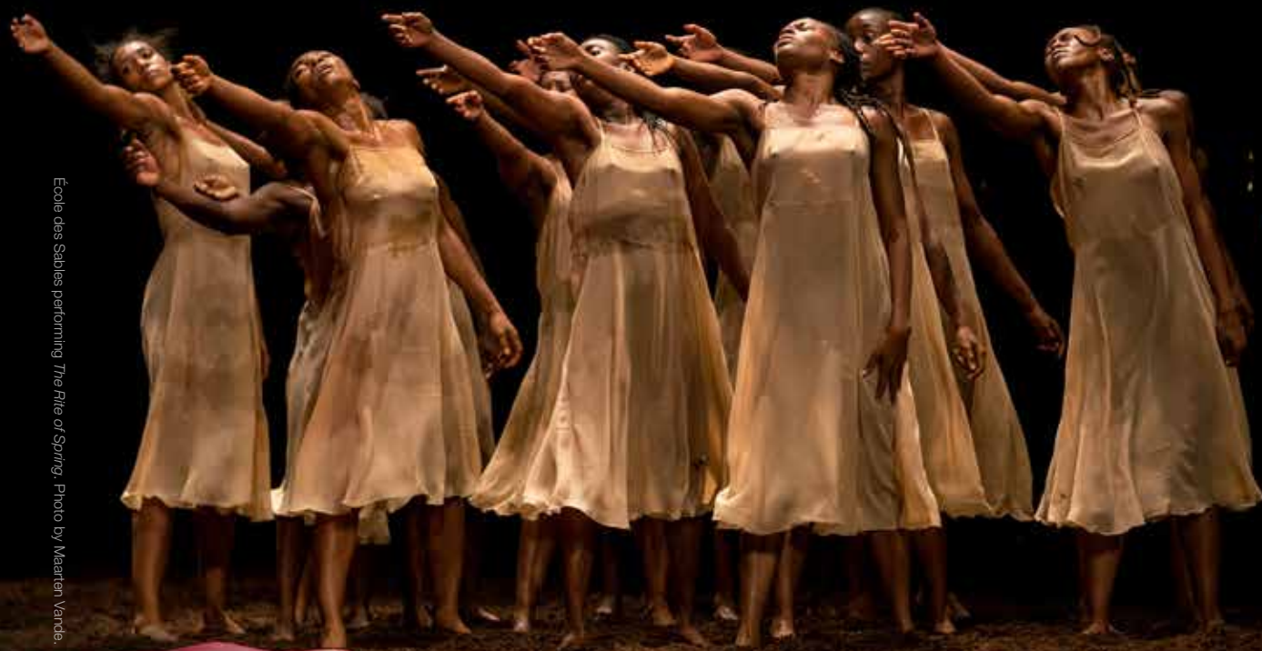
École des Sables performing The Rite of Spring .

Select at least three performances to create a Flex Pack and save 40% on tickets.